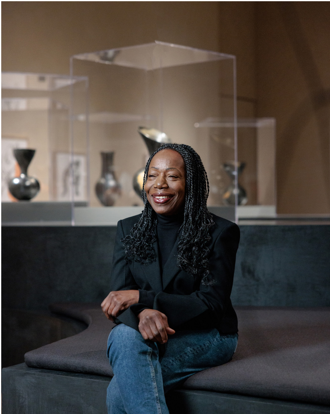
Magdalene Odundo in 2023